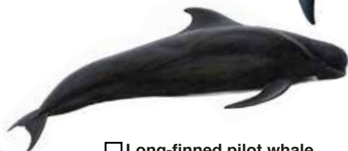
Long-finned pilot whale ( Globicephala melas ) Grindhvalur, marsvín 7 m – 3 t