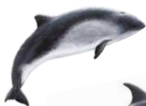
Harbor Porpoise ( Phocoena phocoena ) Hnísa 2 m – 90 kg