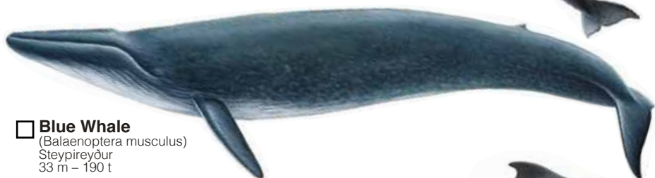
Blue Whale ( Balaenoptera musculus ) Steypireyður 33 m – 190 t