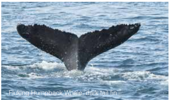
Fluking Humpback Whale, dark tail fin