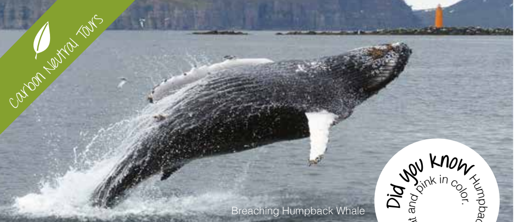
Breaching Humpback Whale