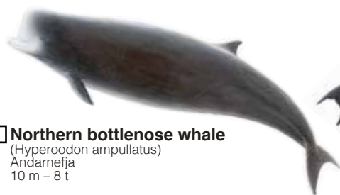
Northern bottlenose whale ( Hyperoodon ampullatus ) Andarnefja 10 m – 8 t