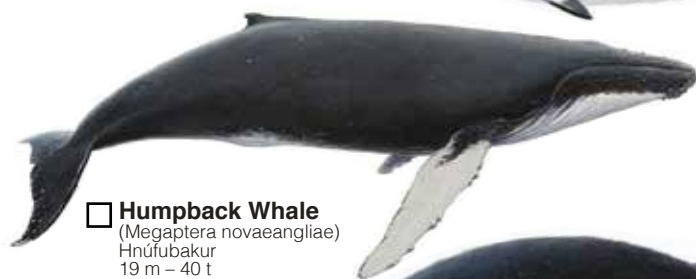
Humpback Whale ( Megaptera novaeangliae ) Hnúfubakur 19 m – 40 t