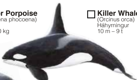
Killer Whale ( Orcinus orca ) Háhyrningur 10 m – 9 t