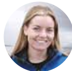
Rósa Ticket sales