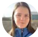
Júlía Ticket sales - Guide