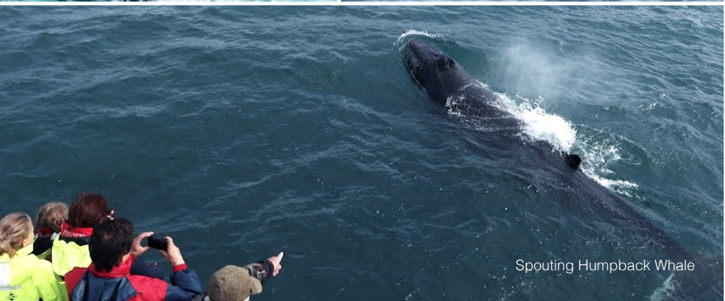
Spouting Humpback Whale