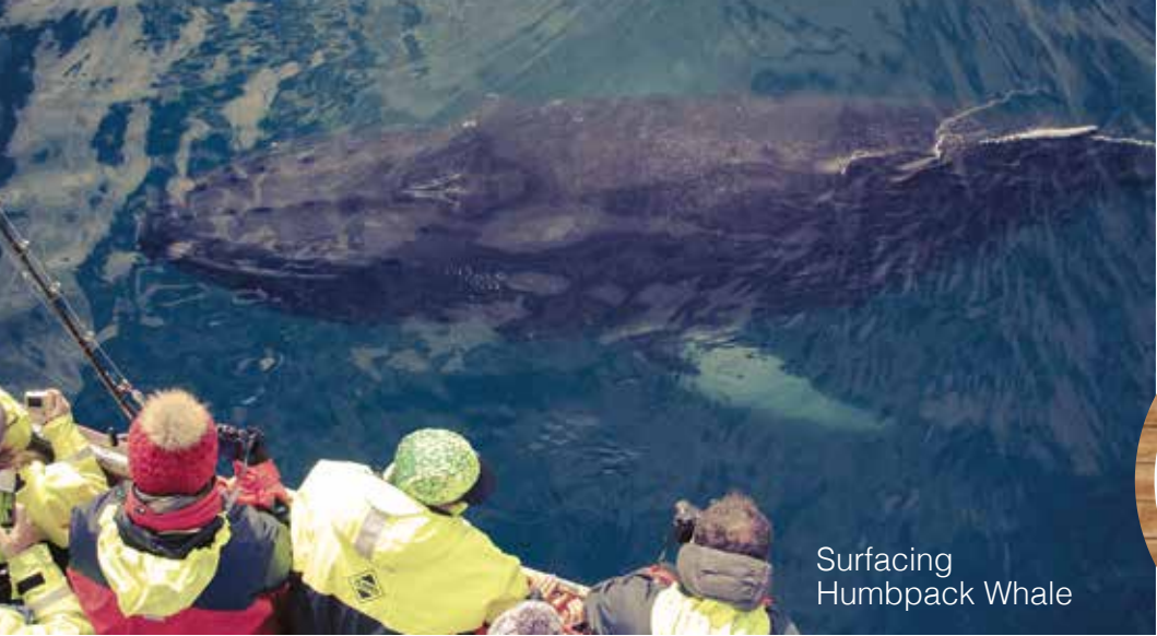
Surfacing Humpback Whale