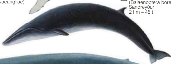
Sei Whale ( Balaenoptera borealis ) Sandreyður 21 m – 45 t