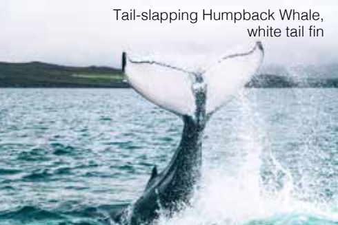
Tail-slapping Humpback Whale, white tail fin